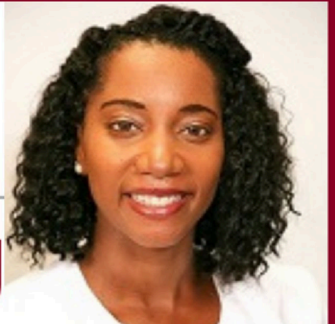
Director and Former Faculty Fellow