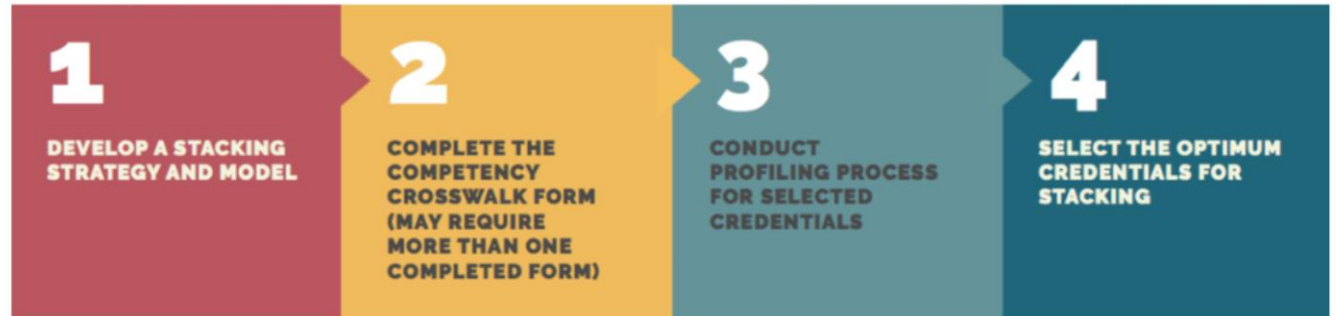
FIGURE 9: EXAMPLE OF CROSSWALK FORM