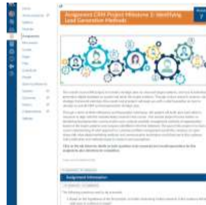
Lead Generation Example - Assignment Page Part 1