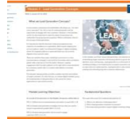
Lead Generation Example - Module Cover Page