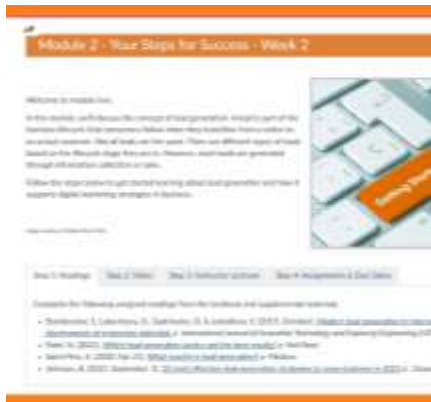
Lead Generation Example - Steps for Success Page