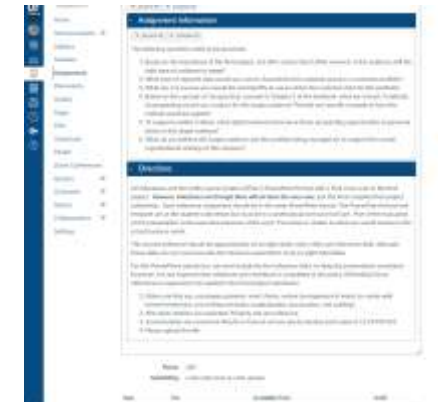
Lead Generation Example - Assignment Page Part 2