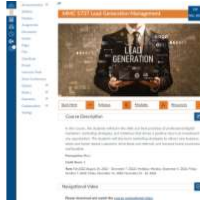
Lead Generation Example - Home Page