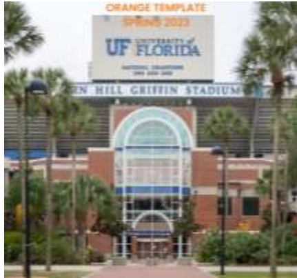
Orange UF Template

Development Process Documents and Examples